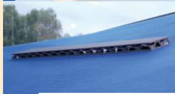
Cavity Drainage Battens

For more information, please visit our website or scan the QR code: