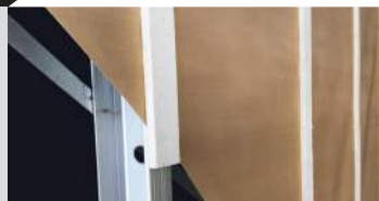
Non-combustible ThermalBreak® Strip