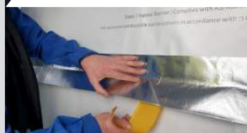
Non-combustible Insulation Flashing Tape

For more information, please visit our website or scan the QR code: